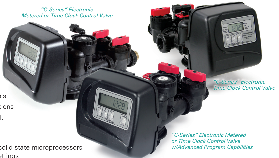
"C-Series" Electronic Metered or Time Clock Control Valve

The "C-Series" control valve has been engineered to provide years of trouble-free service. The key to the exceptional quality of the "C-Series" control valve is in the state-of-art design. The "C-Series" valve is one of the most advanced controls available in a variety of configurations including a solar powered control.