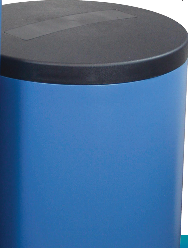
"C-Series" Softener Shown with Optional Bypass & Decorative Tank Sweat Jackets